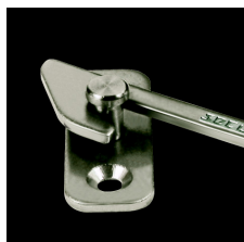
▲ RESTRICTOR mechanism limits maximum opening